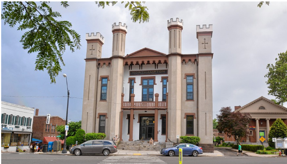
Northampton City Hall